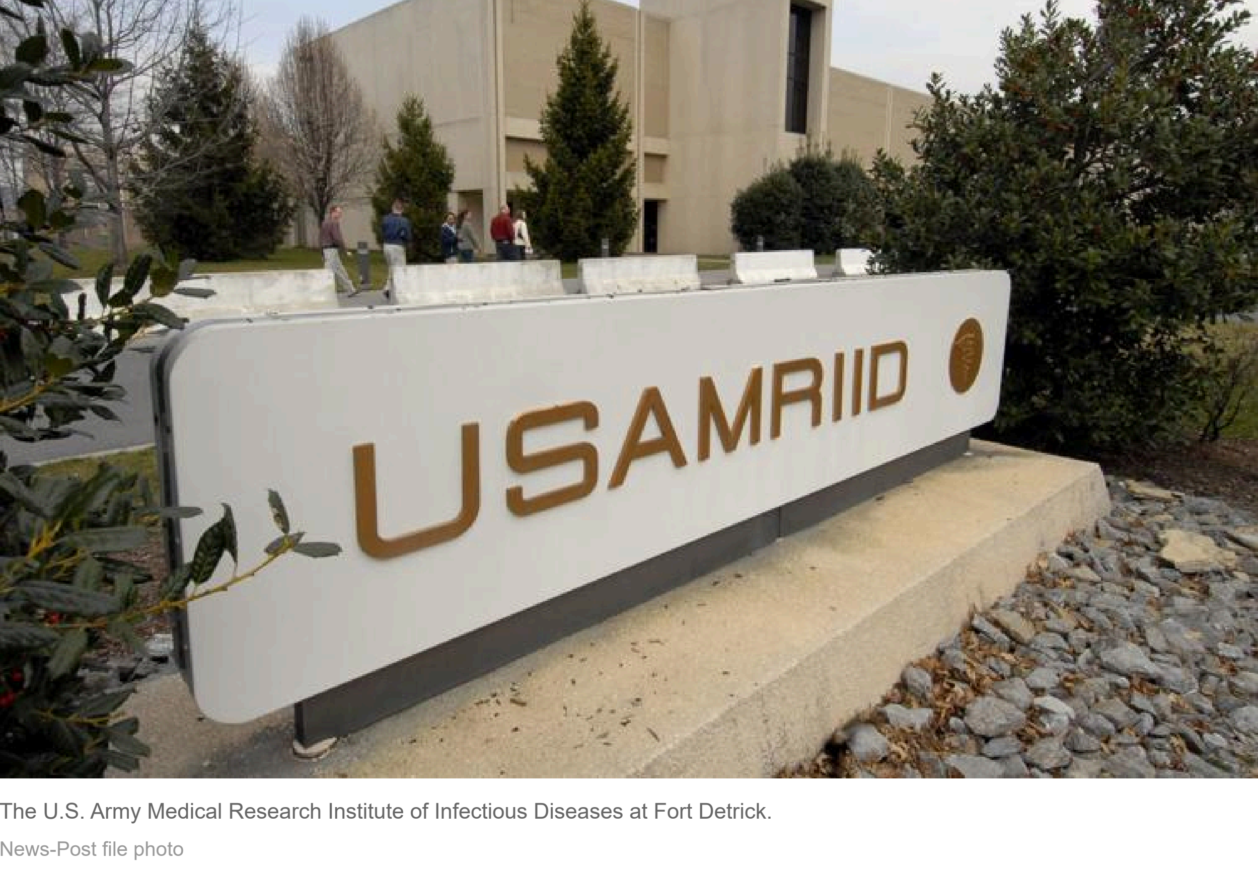
The U.S. Army Medical Research Institute of Infectious Diseases at Fort Detrick.

By Heather Mongillo hmongillo@newspost.com Aug 2, 2019 Updated Aug 3, 2019 10